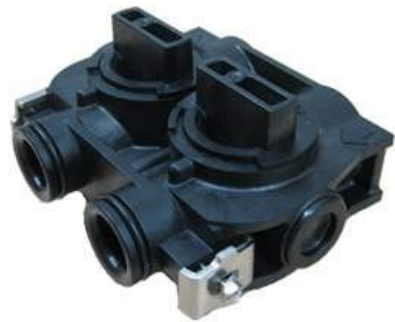
Onyx Bypass - Bypassed Position

Turn each of the handles counter clockwise.