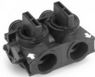
Onyx Bypass - Service Position

Turn each of the handles counter clockwise.